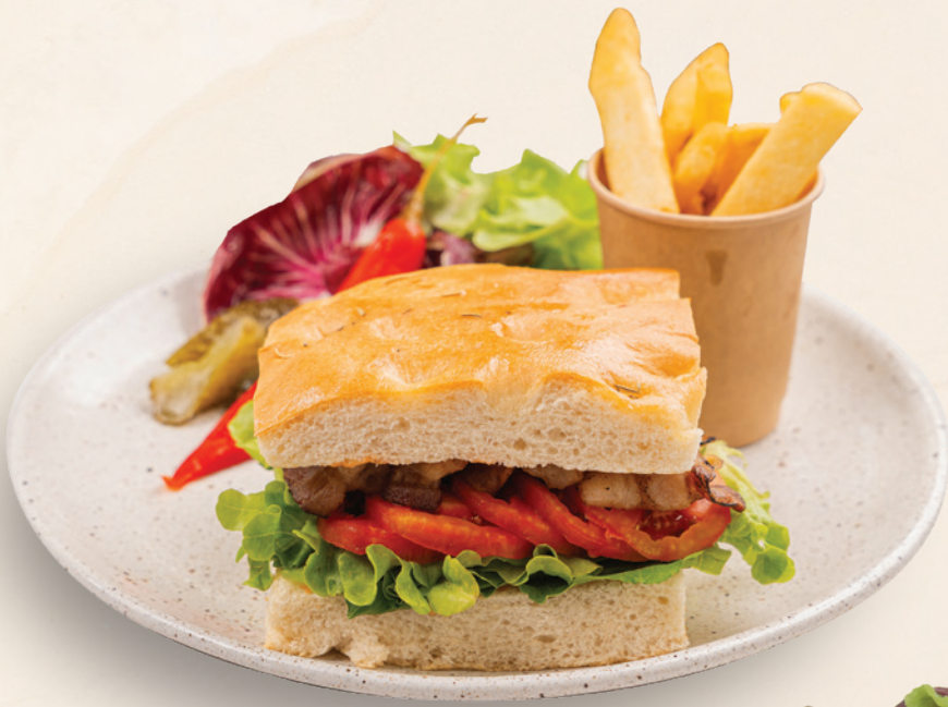
BLT Sandwich 300 Bacon, hydro lettuces, tomatoes.