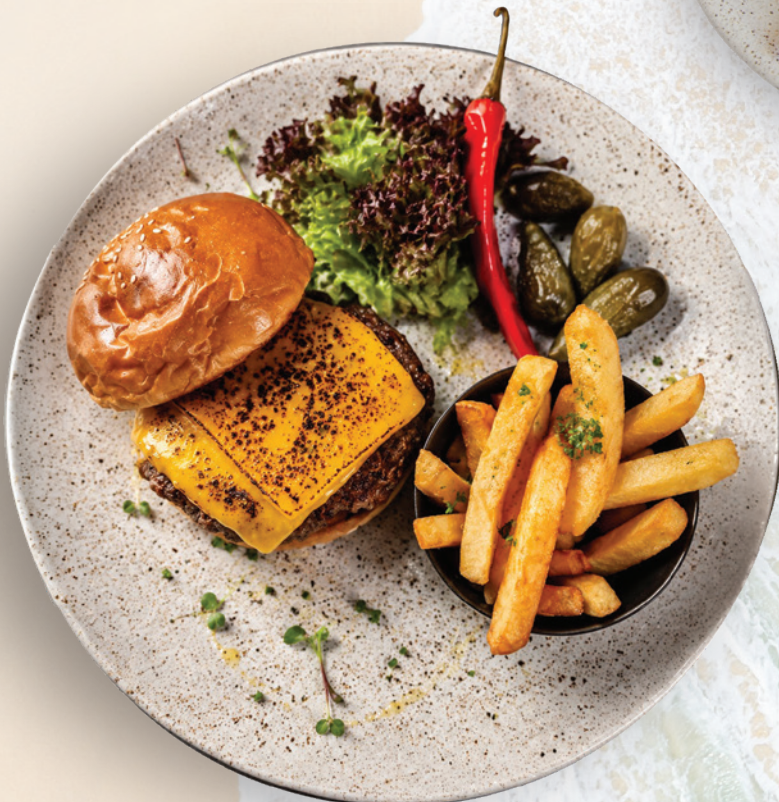
Wagyu Beef Burger 400 Wagyu beef, cheddar cheese, crispy lettuce, tomatoes, gherkins, cocktail sauce.