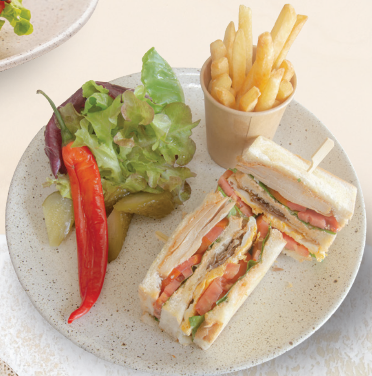
Club Sandwich 325 Chicken breast, crispy bacon, fried egg, tomatoes, lettuce.